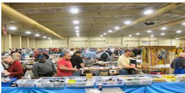
Charlotte Hamfest Swapfest Area

The Mecklenburg Amateur Radio Society, Inc., W4BFB of Charlotte, NC, proudly sponsors this annual event through the Charlotte Hamfest Committee. Spark your new year by being at our 2020 Charlotte Hamfest.