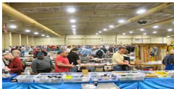
Charlotte Hamfest™ SwapFest Area

Our flea market tables sell out very fast. We have only 312 tables available, and in 2018 we expect to have a SwapFest 'sell-out'. With only 312 SwapFest tables available, get your table order in early . Don't be left out in the winter cold by delaying your order until its too late. Add 'SPARK' to your 2018, by being at our 2018 Charlotte Hamfest™ SwapFest.